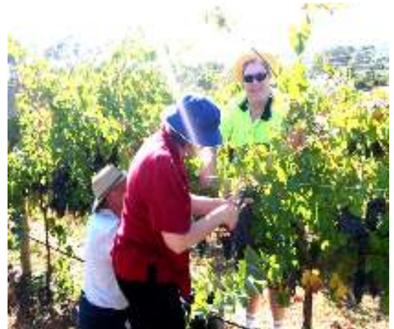
Church-goers picking for charity.

Some of the orphans are genuine orphans; their parents have died of disease; others were living on the streets having been abandoned by their parents who were not able to support them. Sometimes the mother remarries and the new husband does not want them and so throws them out. Some have even been rescued from being sold; their parents who are so incredibly poor, feel they