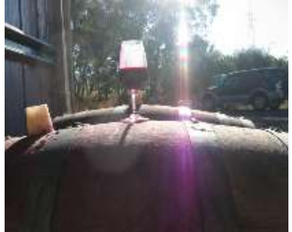
2004 Merlot will be a cracker!

“This year the Merlot is my favorite and I am looking forward to blending some of the Merlot with the Cabernet to make a Cabernet Merlot blend.